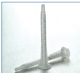
STATIC MIXERS Pack of 10