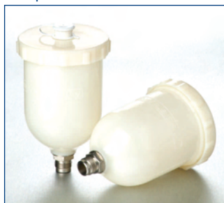
HOPPERS Set of 2