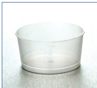
OPEN MIXING POTS Calibrated Pack of 50

Infill 500ml Parts A and B Pigments 10 Colours 30ml 50 1ml Pipettes 25 Open and 25 Closed Mixing Pots Instructions