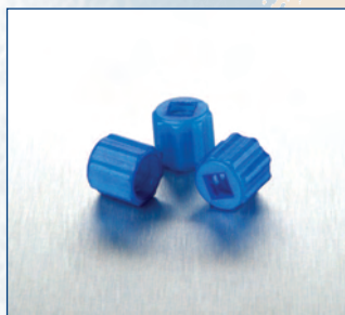
TWIST LOCKS Pack of 10