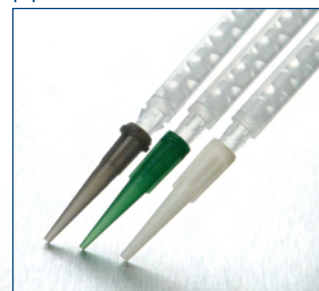
TIPS GREEN 1mm / GREY 1.5mm / WHITE 2mm Pack of 10