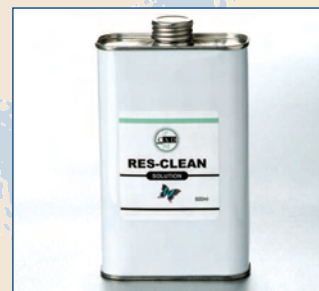
RESCLEAN For removal of resin and cleaning of pumps. 500ml