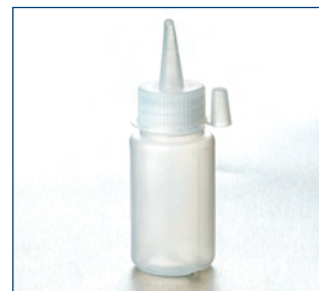
APPLICATION BOTTLE An alternative to mixing pot and pipette. 60ml