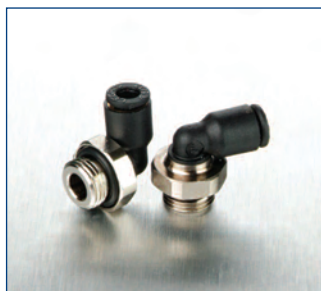
CONNECTORS For connecting tube to pump or mixing head. 4mm ELBOW Pack of 2 4mm STRAIGHT Pack of 2