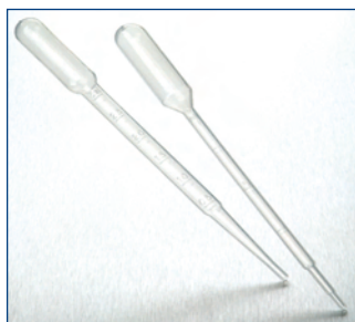
PIPETTES 3ml pack of 50 1ml pack of 50