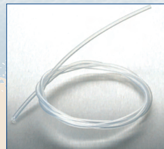
TUBE 5 metres