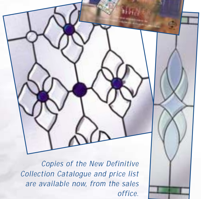
Copies of the New Definitive Collection Catalogue and price list are available now, from the sales office.